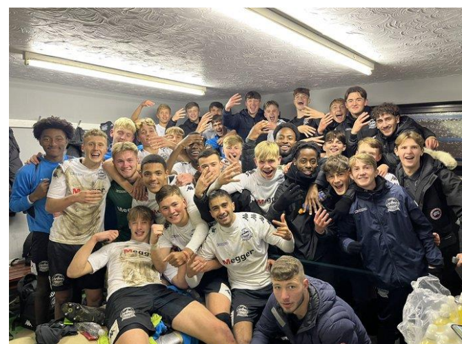
Next season it could be YOU making history with Dover Athletic Academy!

The Academy players were unbelievable on Tuesday evening and have made history!