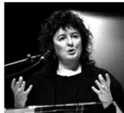
Carol Ann Duffy