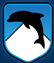
Freddie C Year 10 63HP